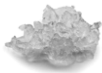
AF 124 Flake ice Residual water content 25%