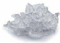
AF 87 Flake ice Residual water content 25%