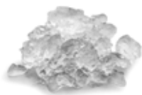
MF 66 Superflake ice Residual water content 15%