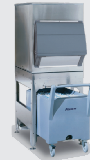
ITS 700 Storage capacity: 296 kg + 110 kg ice cart

Dimensions: W 787 mm D 1016 mm H 1905 mm