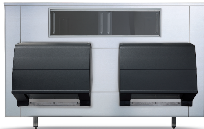
UBH 2250 Storage capacity: 1068 kg

Dimensions: W 1830 mm D 1462 mm H 1285 mm