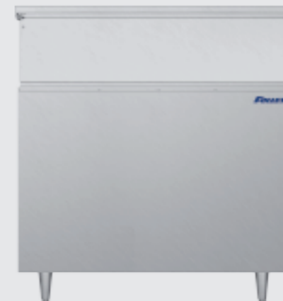
FOL 425 Storage capacity: 195 kg