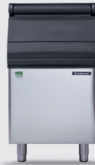
NB 193 Storage capacity: 129 kg

*SIS series ice shuttle storage bins are manufactured by Scotsman Ice Systems, ITS series bins are manufactured by Follett.