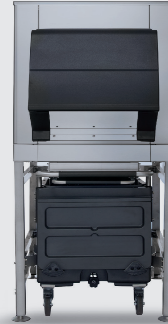
SIS 700 Storage capacity: 318 kg + 73 kg ice cart

Dimensions: W 880 mm D 1265 mm H 1802 mm