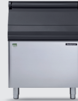
NB 393 Storage capacity: 178 kg