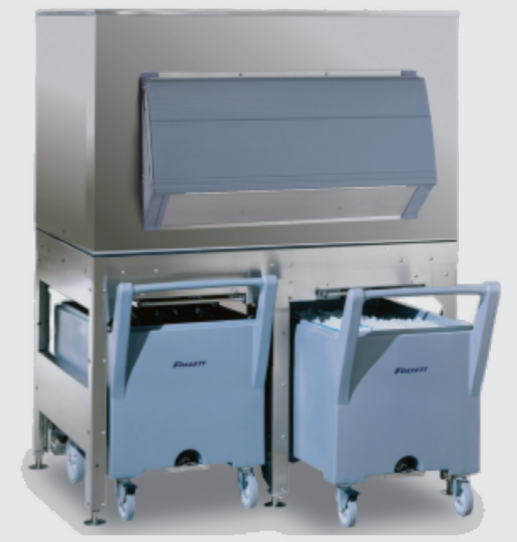
ITS 1350 Storage capacity: 602 kg + 2x 110 kg ice carts

Dimensions: W 1524 mm D 1016 mm H 1905 mm