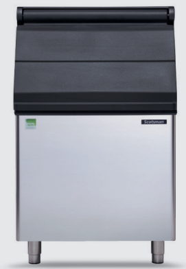
NB 530 Storage capacity: 243 kg