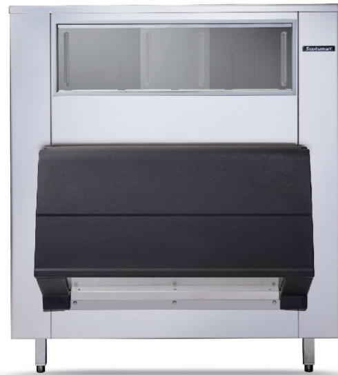
UBH 1100 Storage capacity: 553 kg

Dimensions: W 1220 mm D 1128 mm H 1427 mm