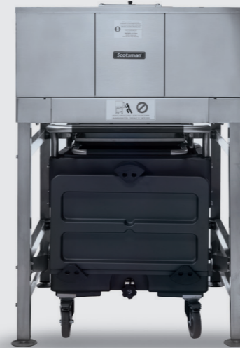
SIS 300 Storage capacity: 137 kg + 73 kg ice cart

Dimensions: W 884 mm D 1025 mm H 1343 mm