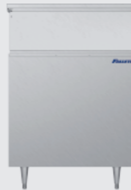
FOL 300 Storage capacity: 136 kg