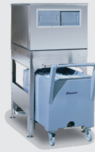
ITS 500 Storage capacity: 174 kg + 110 kg ice cart

Dimensions: W 787 mm D 1016 mm H 1524 mm