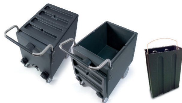
Accessories carts and totes

Dimensions: W 1524 mm D 1125 mm H 1731 mm