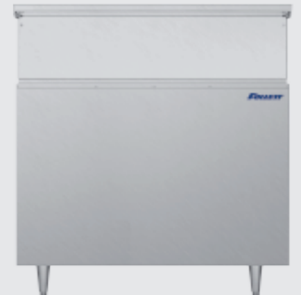
FOL 600 Storage capacity: 246 kg

Dimensions: W 1080 mm D 801 mm H 1020 mm