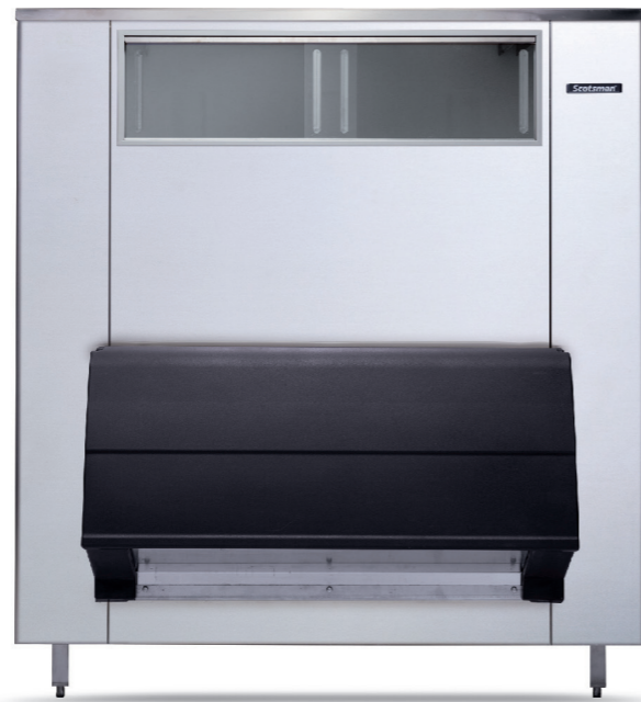
UBH 1600 Storage capacity: 812 kg

Dimensions: W 1524 mm D 1125 mm H 1731 mm