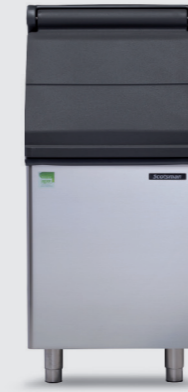
SB 322 Storage capacity: 168 kg