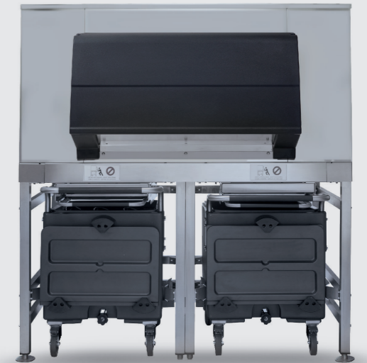
SIS 1350 Storage capacity: 613 kg + 2x 73 kg ice carts

Dimensions: W 1748 mm D 1263 mm H 1802 mm