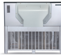
MAR 206 1570 kg