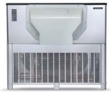
MAR 306 2200 kg