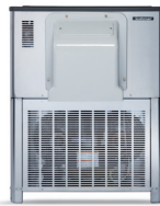
MAR 106 700 kg