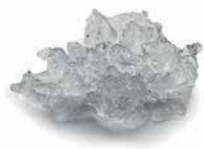
EF 127 Flake ice Residual water content 25%