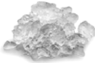
MXF 427 Superflake ice Residual water content 12%